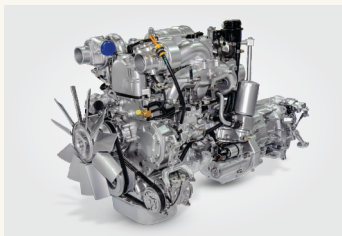
New more powerful Mercedes derived common rail diesel engine.