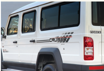
New longer, wider, pressed panel steel body with concealed door hinges.