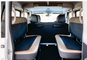
Ample leg room and luggage space