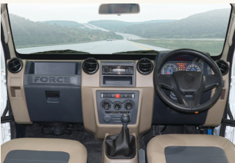
New interiors, new seats, new dashboard, new instrument cluster.