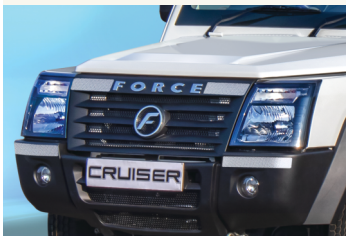
New front fascia, new headlamps, new bumpers with integrated fog lamps.

The TRAX Cruiser, India's popular people mover gets a total makeover. It now comes with a new more powerful Common Rail Engine, a new high strength C-in-C steel chassis, a new modern and more spacious body with new premium interiors. This new platform has been developed keeping in mind all aspects of convenience, safety ergonomics, drivability and passenger environment.