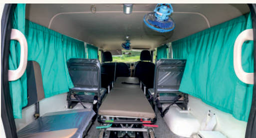
Foldable seats for convenient movement, Swivelling Fans and Ample lighting