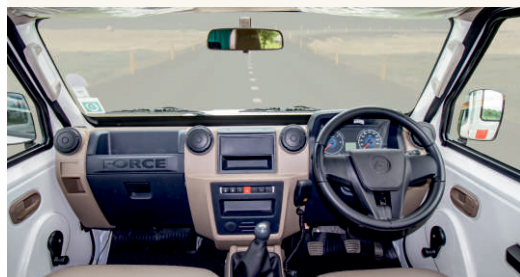
All new interiors, new seats, dual tone dashboard and new instrument cluster

The fully factory built, All New Trax Ambulance is ready to use from day one. The independent front suspension and parabolic rear suspension ensure best in class ride quality for the patient. The new G-28 Synchromesh Gear Box with Cable Shift ensures smooth and quick gear changes. The Trax Ambulance is ideal for use in narrow congested lanes and the rough road conditions in the rural areas.