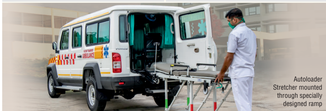
Autoloader Stretcher mounted through specially designed ramp