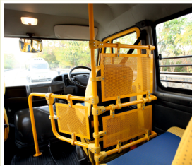
Large Internal Rear View Mirror and Driver partition