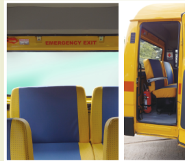
Emergency Exit Door for Easy Exit