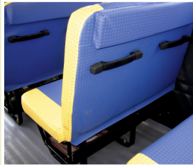
Chin Guard & Grab Handle