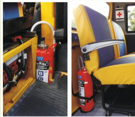
Fire Extinguishers in case of an emergency