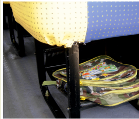
Racks for School Bags