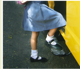
Low foot step for easy Entry & Exit