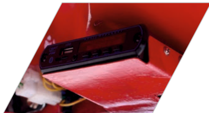
USB FM Radio and Speaker