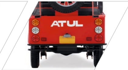
Modern Look LED Tail Lights