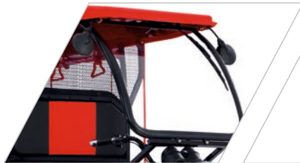
Wiper Motor Available