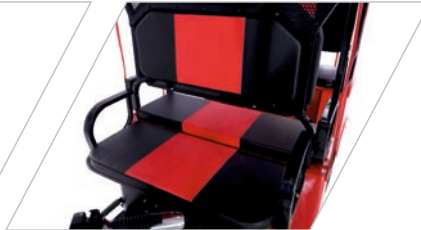
Elegant Dual Tone Seat Covers