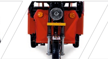
Strong Front Suspension