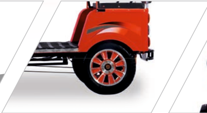
Attractive Alloys Wheels with Graphics