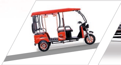
Booster Gear for Better Gradeability