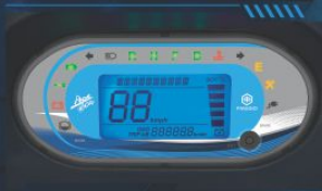
Full digital cluster