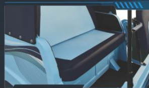
Dual tone interiors