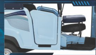
Doors for safety